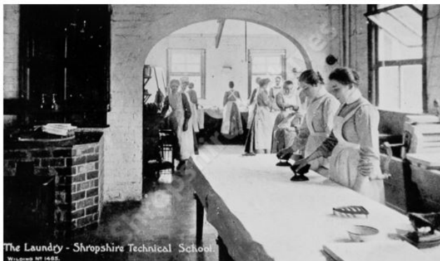
The Laundry, Shropshire Technical School, Radbrook, Shrewsbury

SA, PH/S/13/R/2/6: The Laundry, Shropshire Technical School, Radbrook, Shrewsbury (early 20th C.)