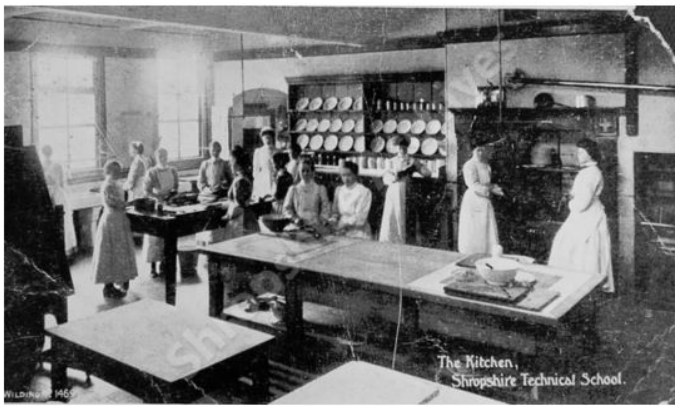
The Kitchen, Shropshire Technical School, Radbrook, Shrewsbury

SA, PH/S/13/R/2/7: The Kitchen, Shropshire Technical School, Radbrook, Shrewsbury