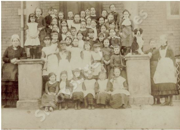
Group photo, Millington's School, Frankwell, Shrewsbury